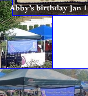
stART on the stree September 17